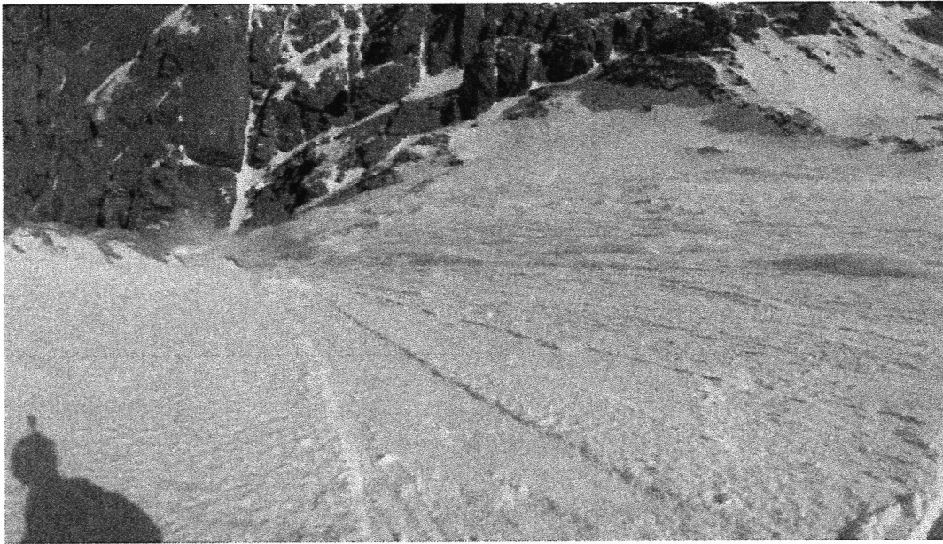
Figure 2: sluff